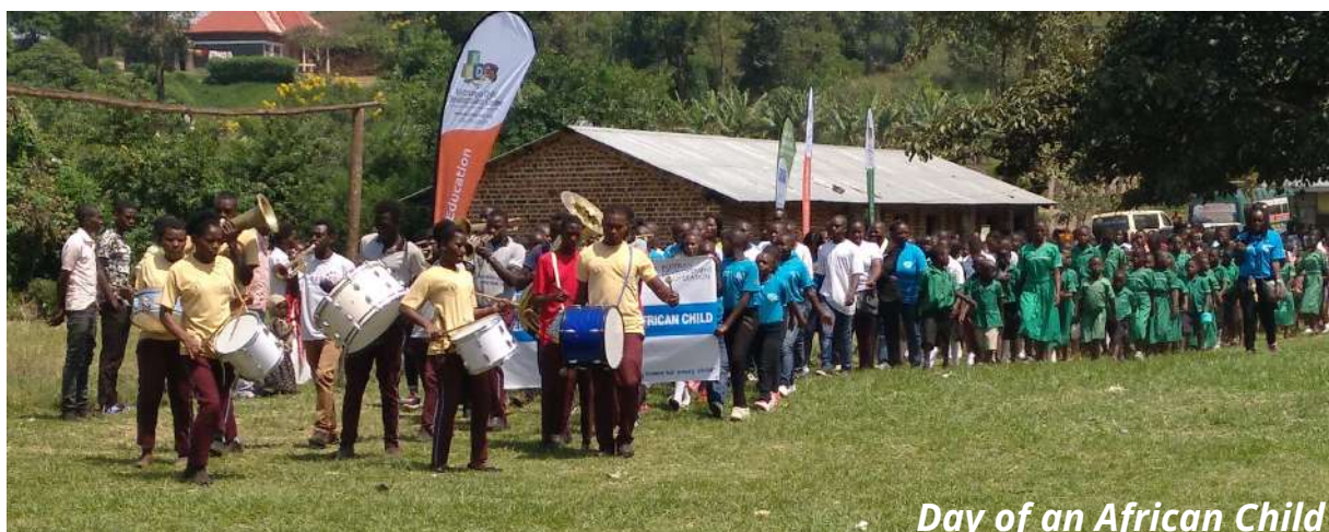
Day of an African Child