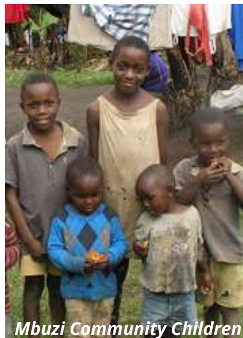
Mbuzi Community Children

The reality analysis was made based on interviews(interface) and data collected about health status, hygiene habits, education level, type of diet, hobbies, relating to all of the family members. We analysed the environment (access to water and electricity), the condition of the houses, kitchens, showers and latrines. The assessments made, primarily detected poverty, lack of basic needs, no school fees and dues for minors of school going age, among others.