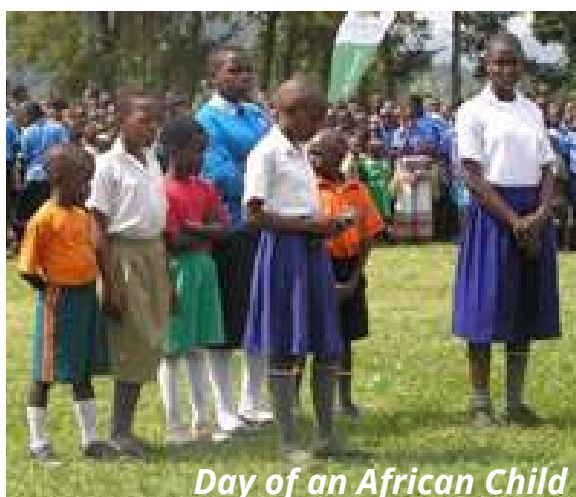
Day of an African Child

On June 16th, The Day Of an African Child is celebrated. Events organised by Kabarole District, under the theme “Humanitarian Action in Africa”, Children's Rights First”. These event happened throughout the week and the closer took place at Nyabweya Primary School, Kasenda Sub-County