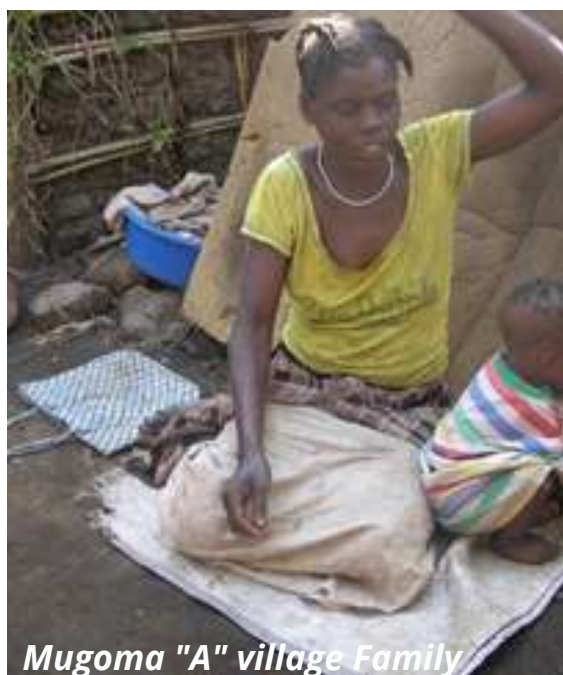
Mugoma "A" village Family

The first direct contact with the families had its difficulties. Even there were families that refused to enter the program, It is very important to gain trust and confidence of the beneficiaries, this is a process that comes with time coupled with serious work done. Based on the data obtained, the actions and projects to follow in 2019 were prioritised: "ebirungi bijja mpora"... translated.."good things come slowly" or one at a time.